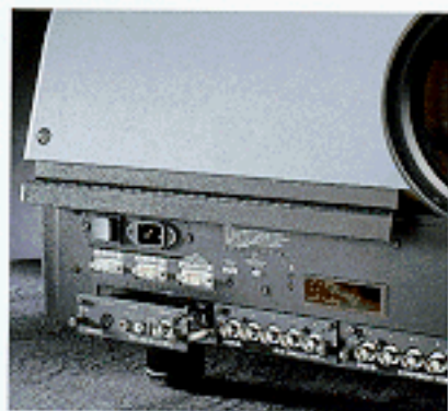
The BarcoData 9200 has a modular input design which accommodates a variety of input modules for different video and computer data sources.